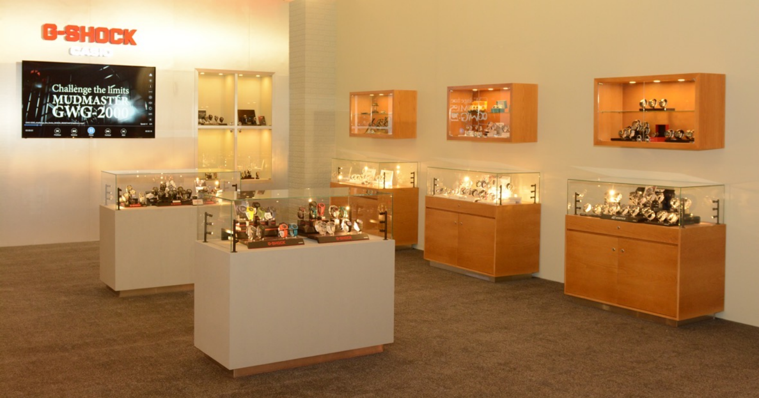
CASIO (G-SHOCK) Show Room Production Shangri-La Hotel